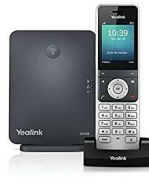
Yealink DECT Cordless