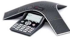
Polycom SoundStation Conference Phones